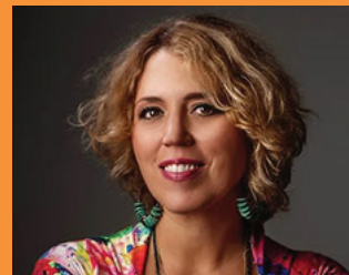
Gabriela Montero Pianist and Composer